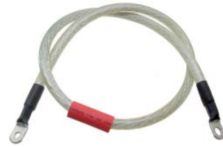
95A15-33C04-CL Cable Wire