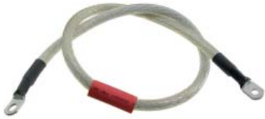
95A15-30C04-CL Cable Wire