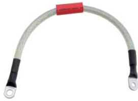
95A15-14C04-CL Cable Wire