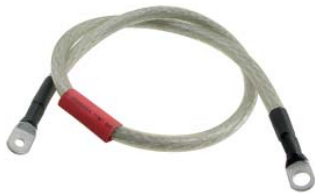
95B13-30C04-CL Cable Wire