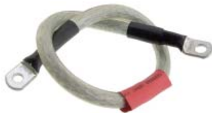
95A15-16C04-CL Cable Wire