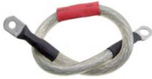
95B13-16C04-CL Cable Wire