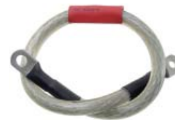
95A15-17C04-CL Cable Wire