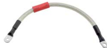
95A15-13C04-CL Cable Wire