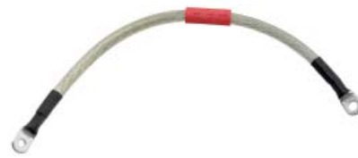
95A15-15C04-CL Cable Wire