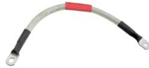
95A15-11C04-CL Cable Wire