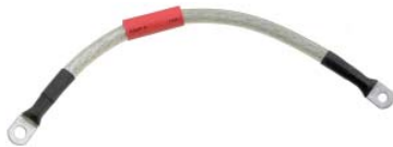
95A15-12C04-CL Cable Wire