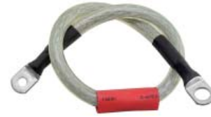
95B13-17C04-CL Cable Wire